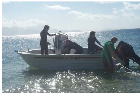
Recent Pelorus Trip